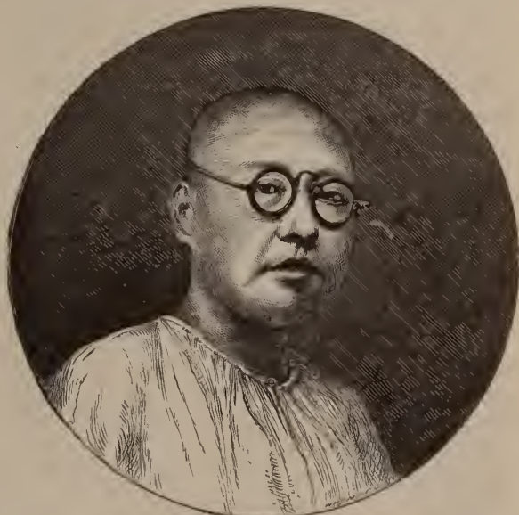
A CHINESE MERCHANT.

custom of conducting preaching services in Christian countries, in China any Christian with some knowledge and experience is expected to bear testimony to the truth, no matter whether he holds the office of preacher or not. It was during one of these series of discourses that a young man entered the chapel and listened to the truth, almost for the first time, and, singularly enough, realized that it contained the word of eternal life. As soon as the service ended the usual invitation was given for any interested person to remain a little while